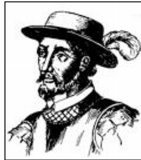
Juan Ponce de León